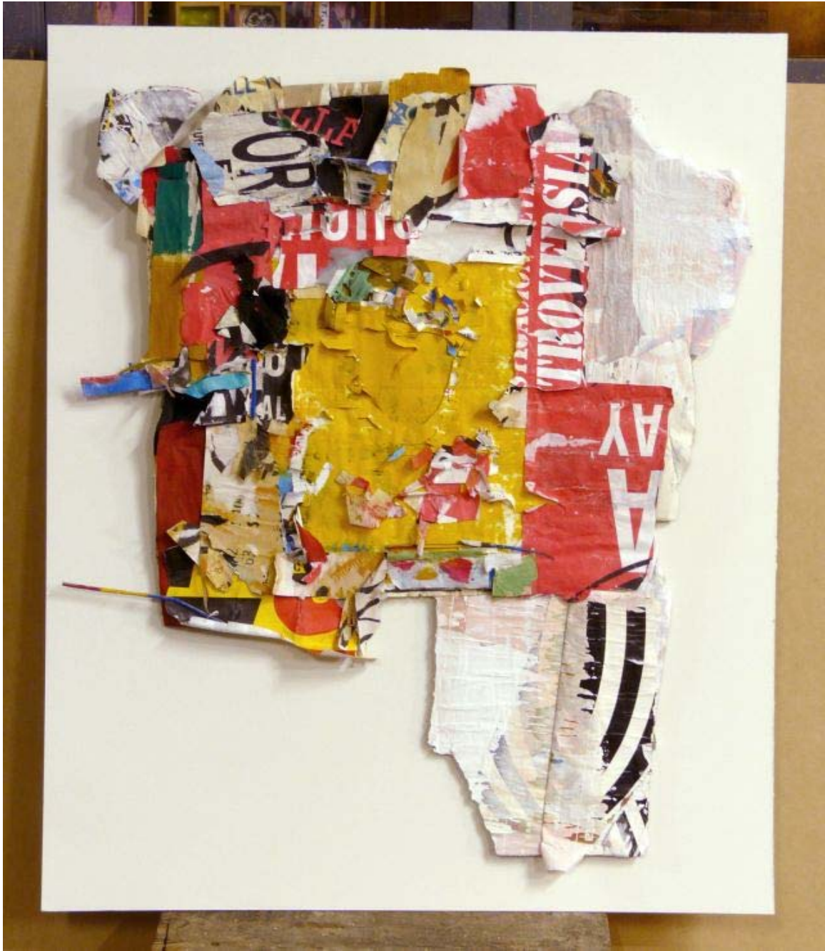
Ernesto Vila, Des-imágenes, 2009 | Galería del Paseo