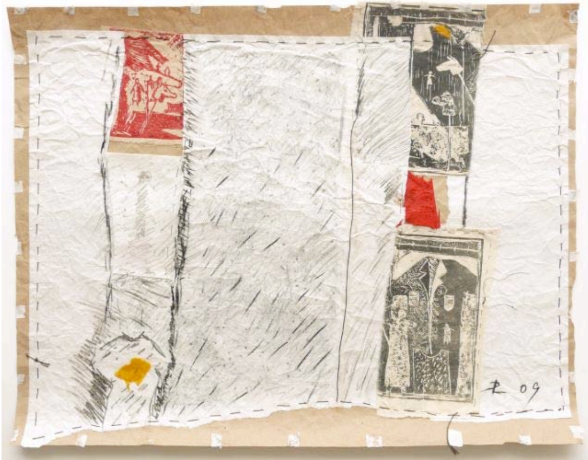
Lacy Duarte, Untitled, from the serie "de las Traperas," 2009 | Galería del Paseo