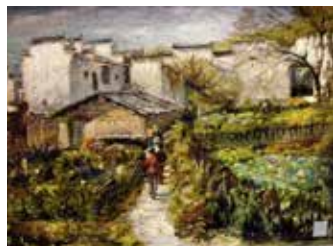
LV CUN, B.1955 THE ANCIENT VILLAGE IN ANHUI, 2015 Embroidery 30X40 cm