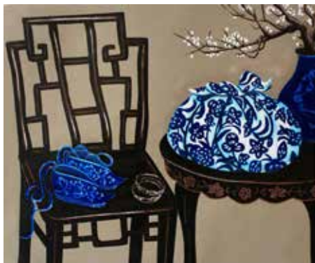
SHEN CHUNXIA, B.1964 RETURN-PROFOUND LONGING 2011 Prints 120X100cm