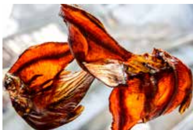
HU YONG, B.1957 FLYING, 2015 Collect Art Level Micro Spray 100 X 130 cm

Abstract photography, in artist Hu Yong's point of view, should be an image production process that goes beyond the subject itself yet still reflects the essence of that subject. By going beyond the subject itself, an image departs from merely reproducing natural appearances and tries to express something else - something unreal. This is where the charm of abstract photography lies. The process is a combination of inspiration and creativity.