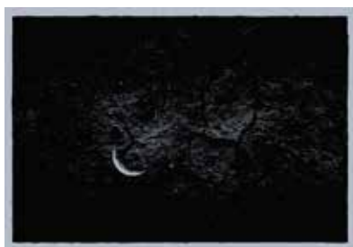
HU YONG, B.1957 THE WAXING & WANING OF THE MOON, 2015 Collect Art Level Micro Spray 100 X 130 cm