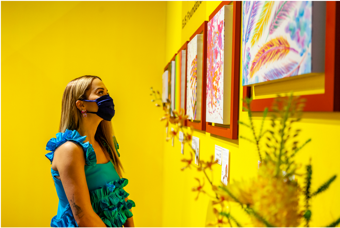
Rita Ora viewing artwork in the St. Jude booth at the LA Art Show 2021.