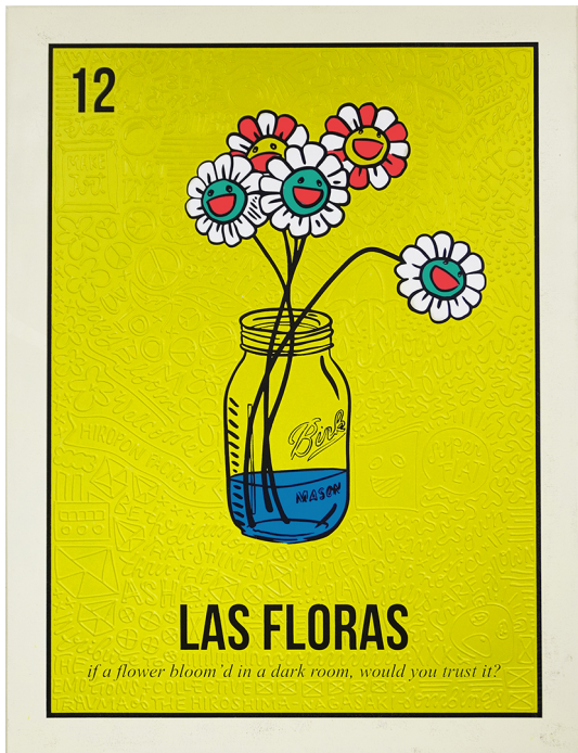
Cayla Birk LAS FLORAS, 2022 Acrylic, Spray Paint, Silicone, Ink on Canvas 48 x 36 in (121.9 x 91.4 cm)

We're pleased to welcome MRG Fine Art as an exhibiting gallery at the LA Art Show for the tenth year. To celebrate this anniversary, co-curators Michael Goodman and Tara Barone of MRG Fine Art will present, The Artist Collective, an exhibition showcasing more than 25 local contemporary artists, age 20 to 90, as a tribute to the gallery's Los Angeles roots.