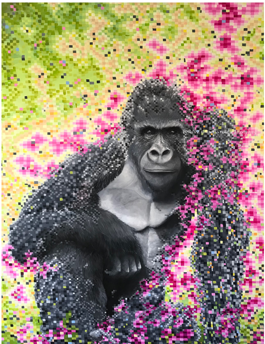
Bert Esenherz Sky the Gorilla, 2023 Oil on Canvas 112 x 82 in (284.5 x 208.3 cm)

The exhibition is grounded in a mission to provide an open platform for a diverse roster of emerging and established artists. With more than 120 artworks at a range of prices in various mediums and genres, The Artist Collective is accessible to all levels of collectors.