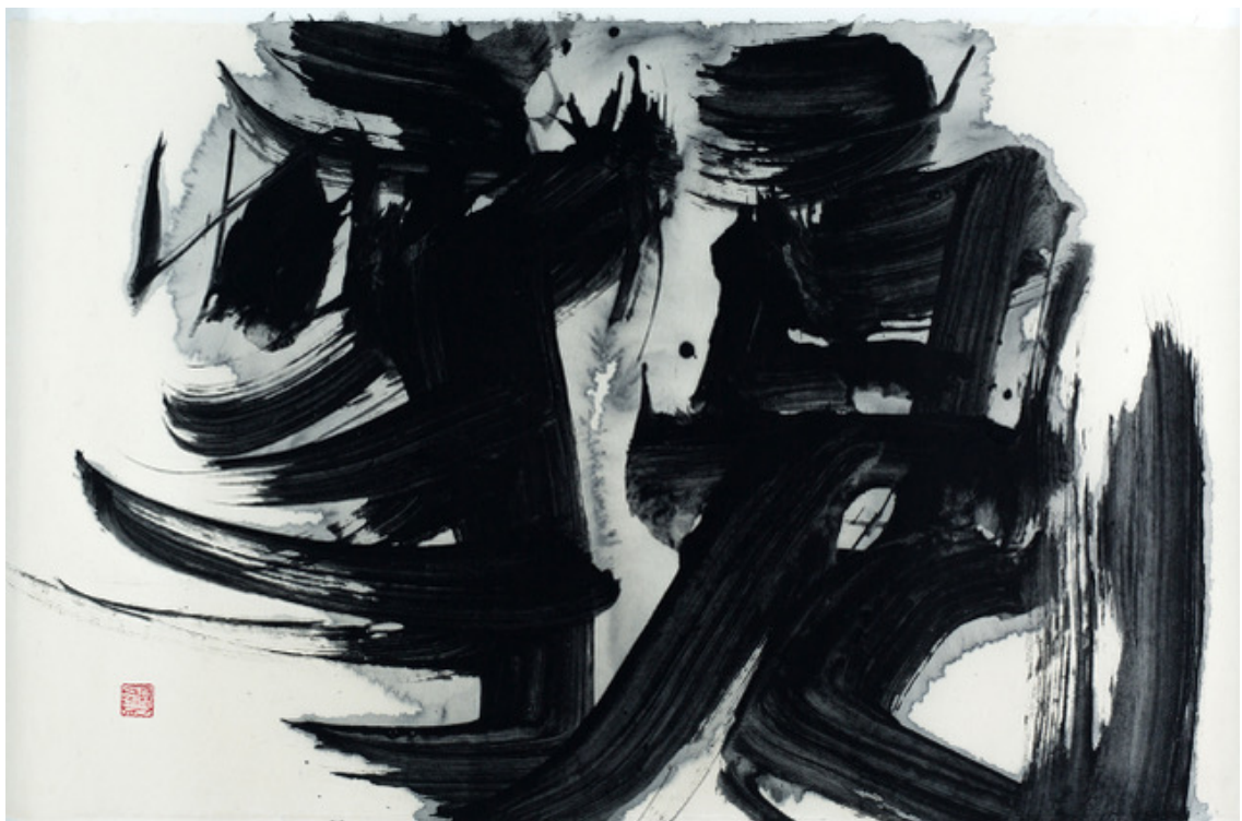
Sanmu Kunisada: One's true color, 2014, Sumi-ink on paper, wood panel (60 x 93 cm) presented by Gallery Kitai