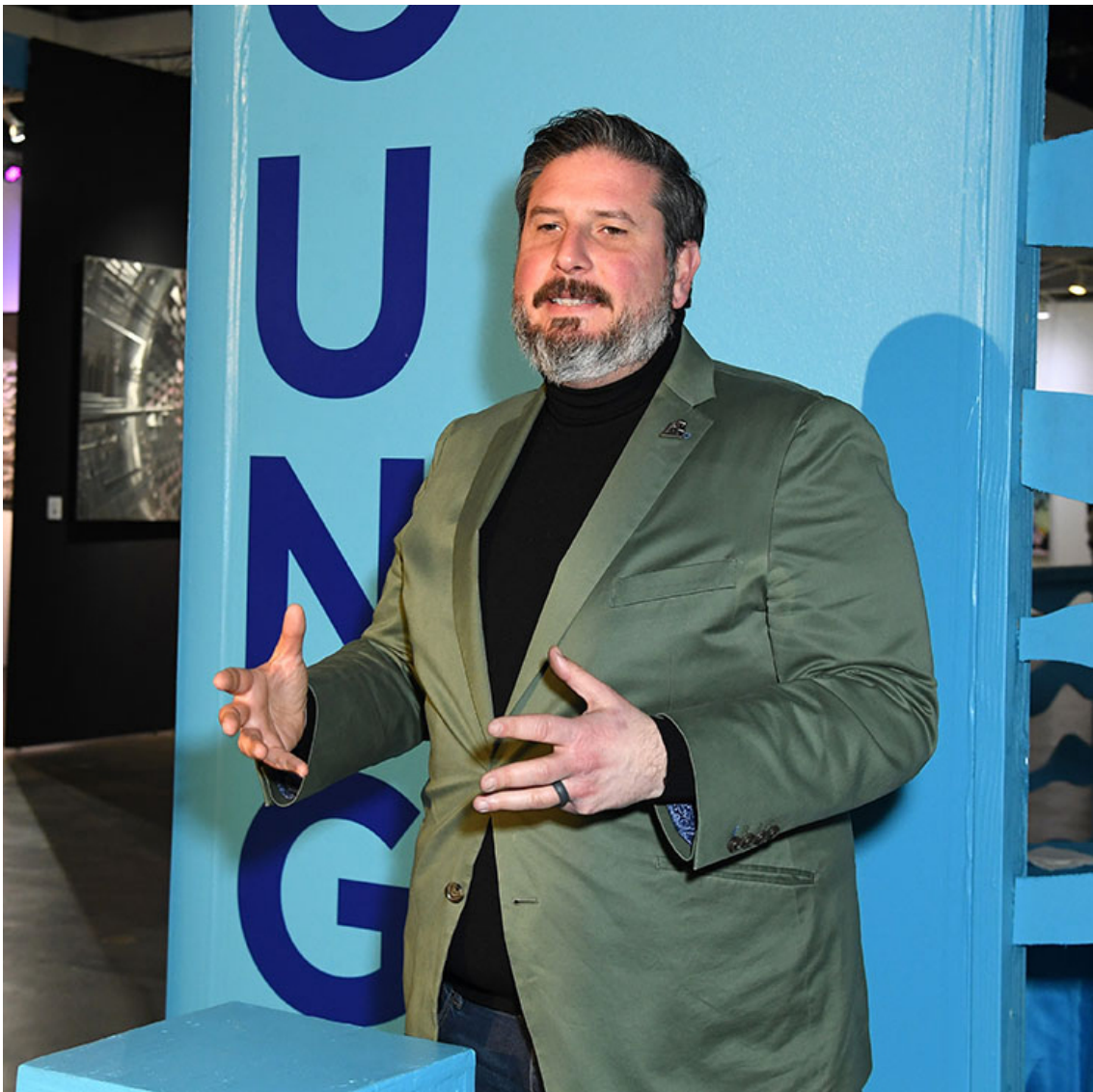
Ardy Kassakhian, Glendale Library Art Gallery / City of Glendale Mayor