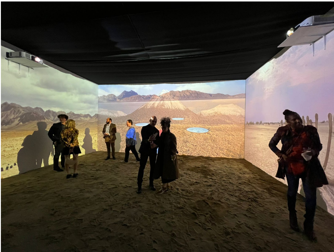
AMA Museum of the Americas / Alfredo De Stefano artist: The Pulse of Silence , part of DIVERSEartLA