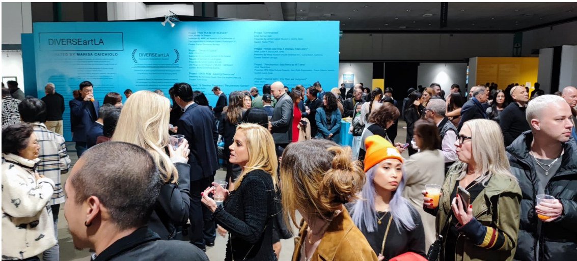
Visitors gather outside DIVERSEartLA exhibitions on opening night.