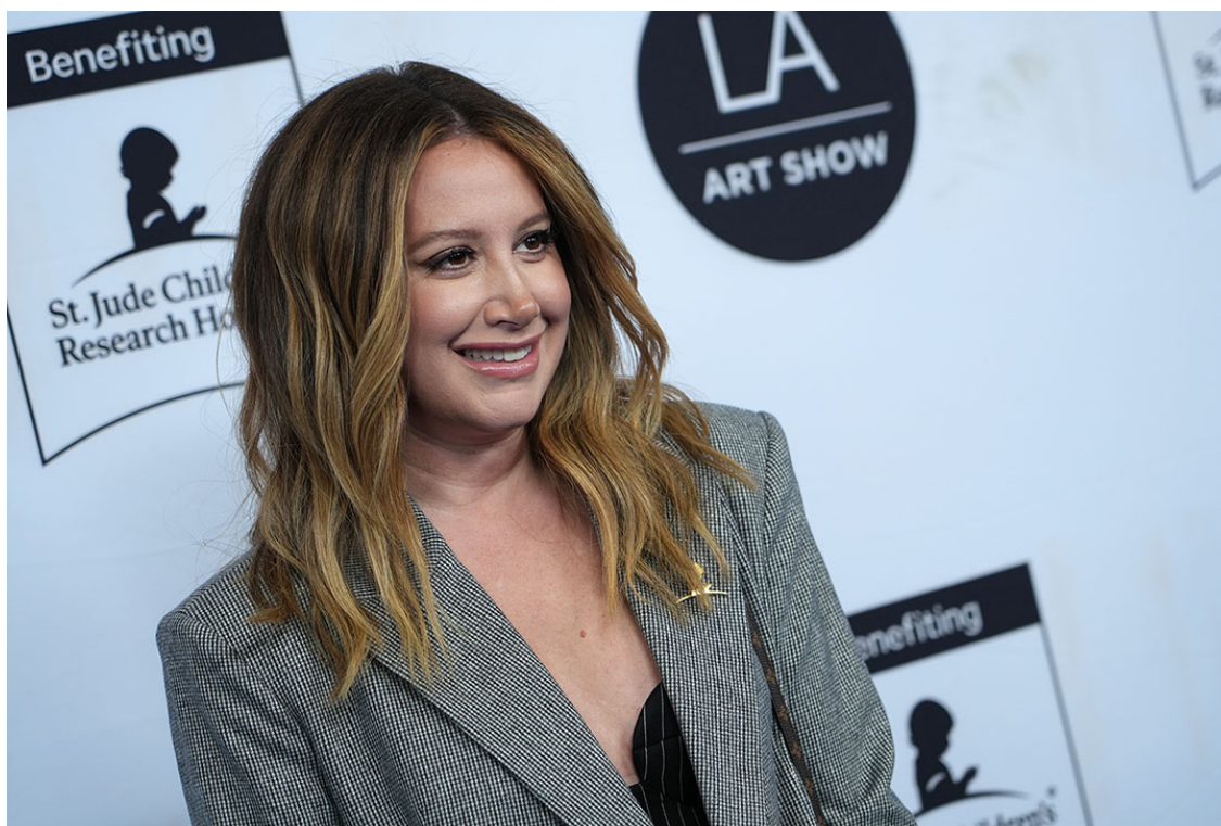
LA Art Show Celebrity Host, Actor Ashley Tisdale

Here are some more highlights from the evening: