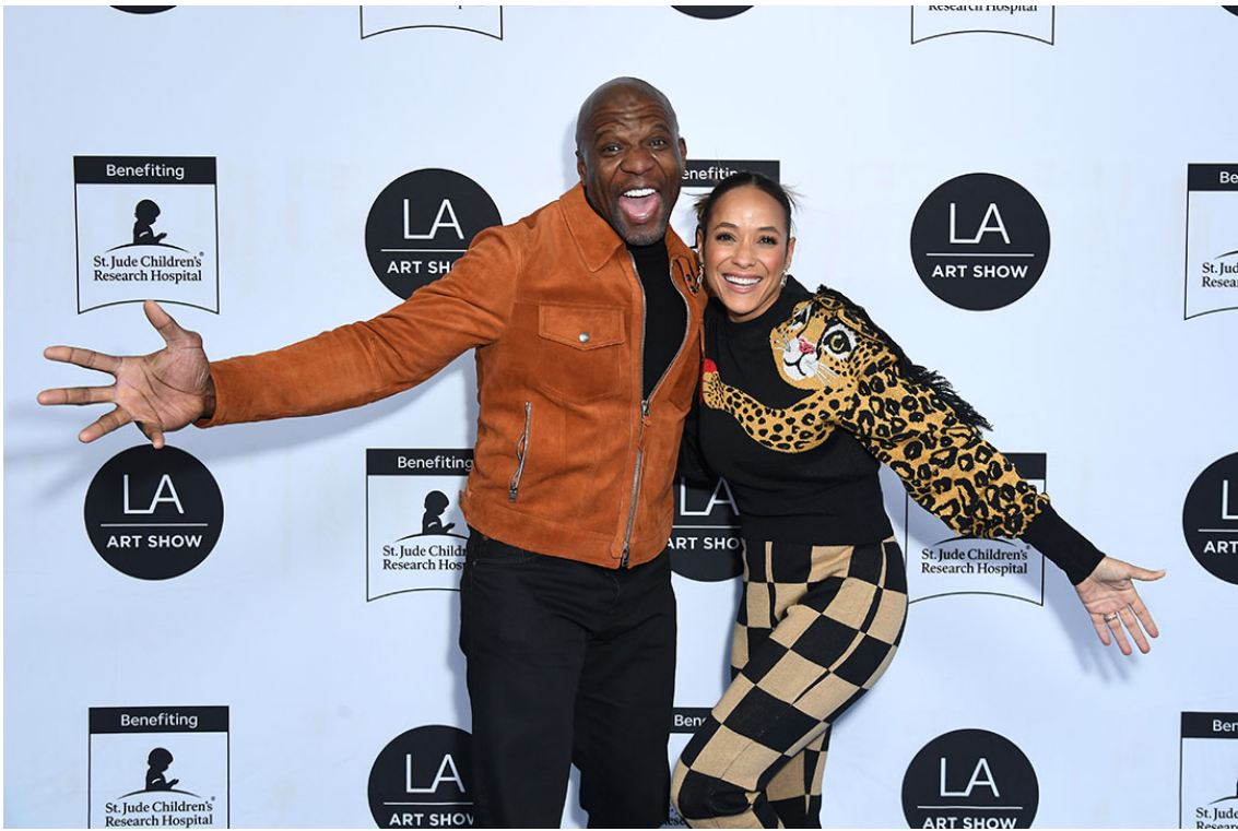
Actors Terry Crews (L) and Dania Ramirez attend the LA Art Show opening night premiere party.