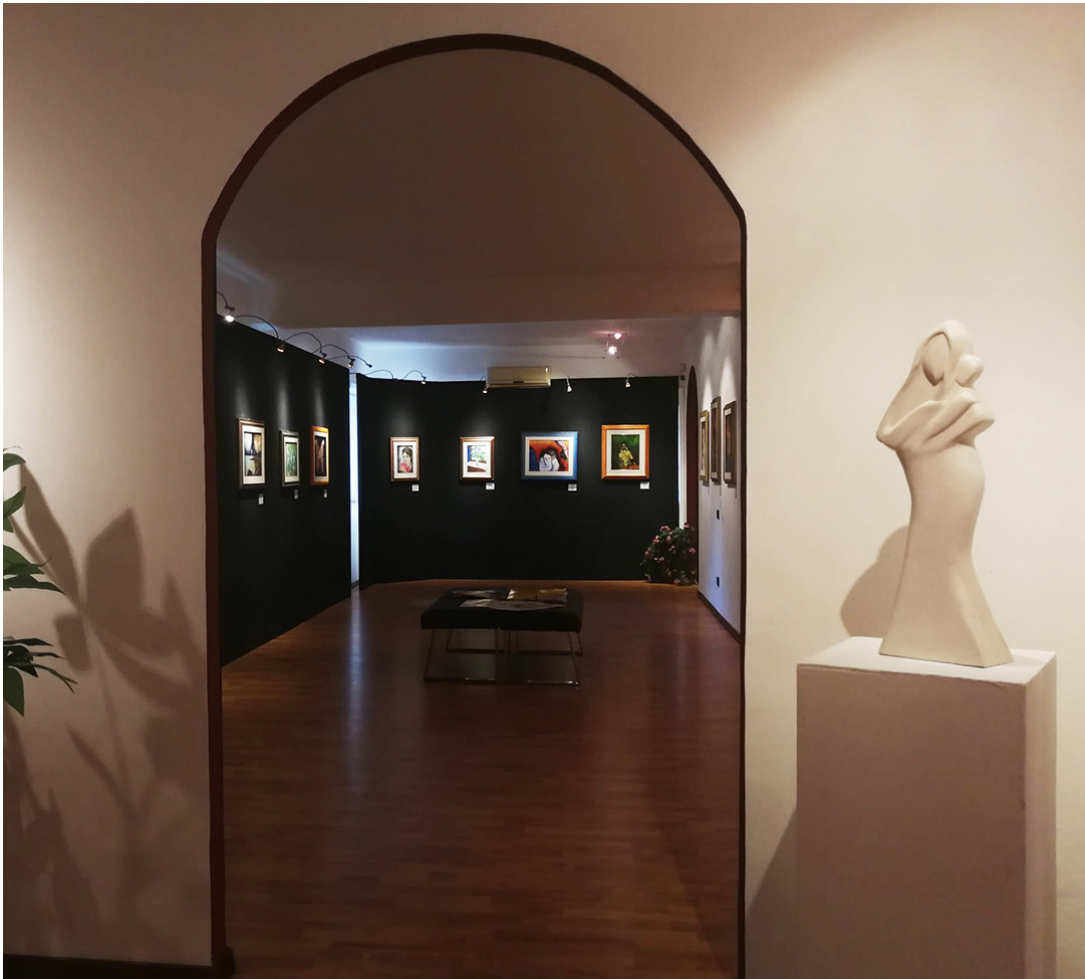
Effetto Arte Gallery

Find out more about the gallery and foundation here .