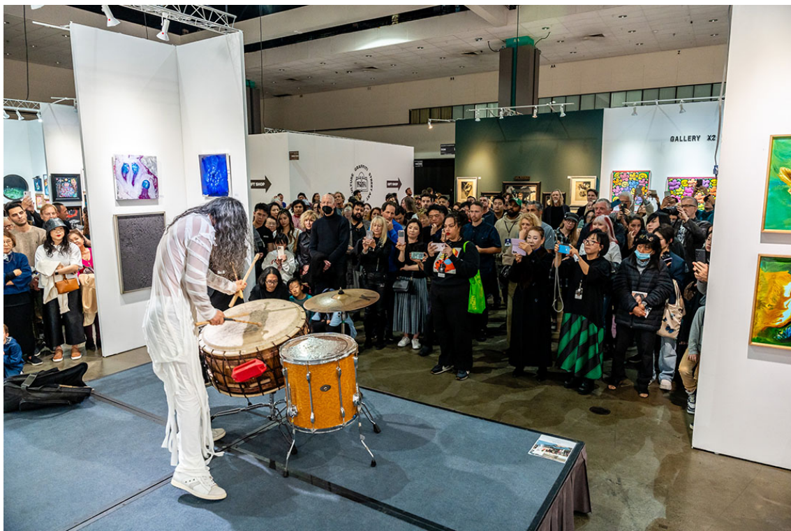
Choi Sori percussion performance, presented by Art in Dongsan