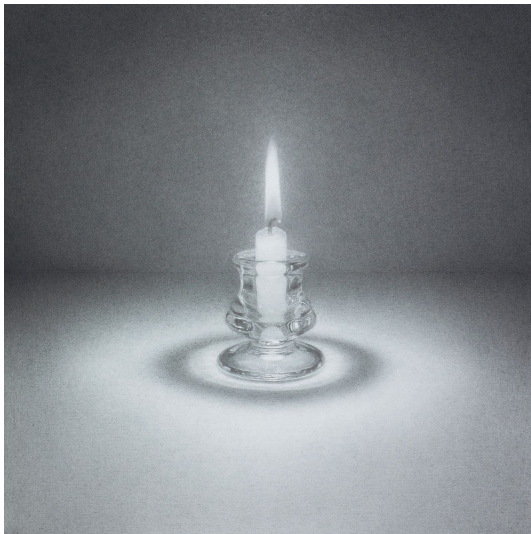
Izumi Akiyama, 2019 Still Life VI , Pencil on Paper