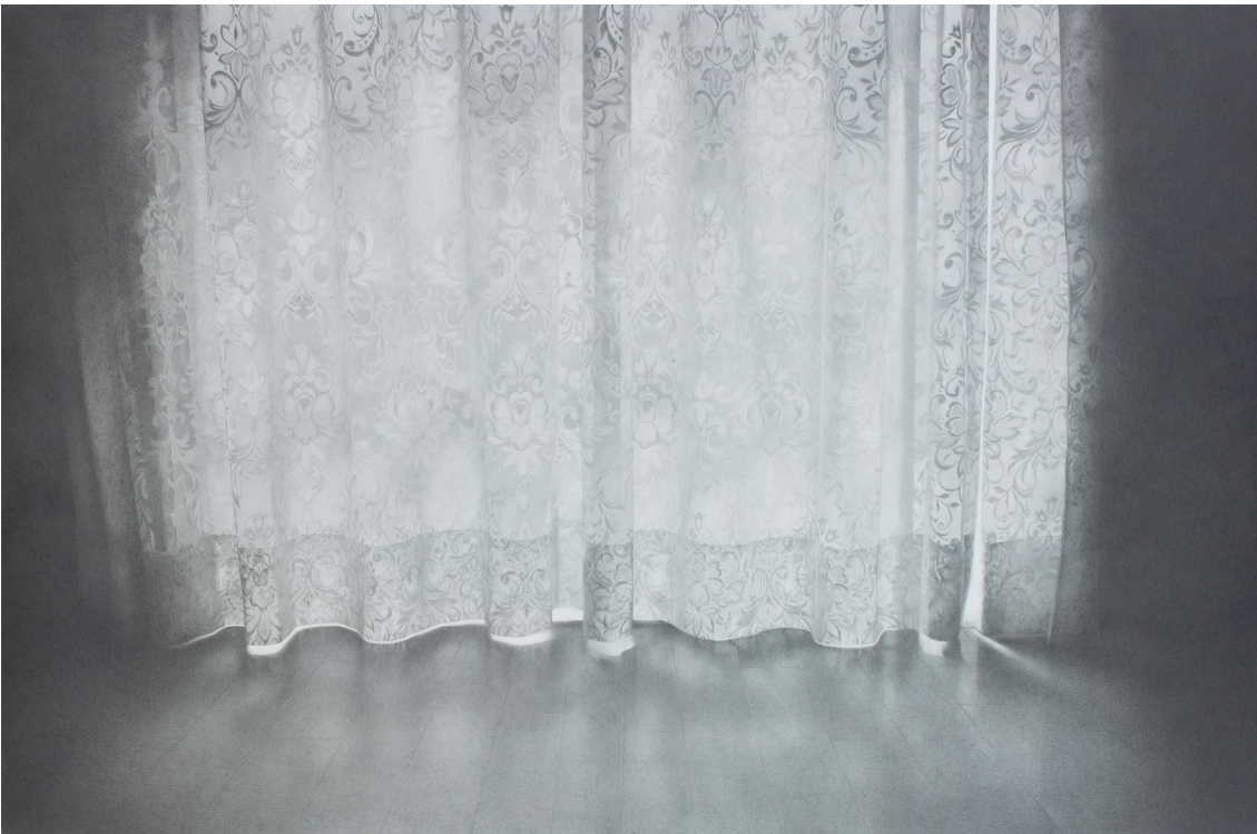
Izumi Akiyama, 2018 Interior I , Pencil on Paper

Kobayashi Gallery was established in 1978. The gallery’s program focuses on the works of young and mid-career artists, including 3D artists. With the emergence of a stable domestic market for new talent, Kobayashi has set its sights on introducing the work of young Japanese artists to the overseas market.