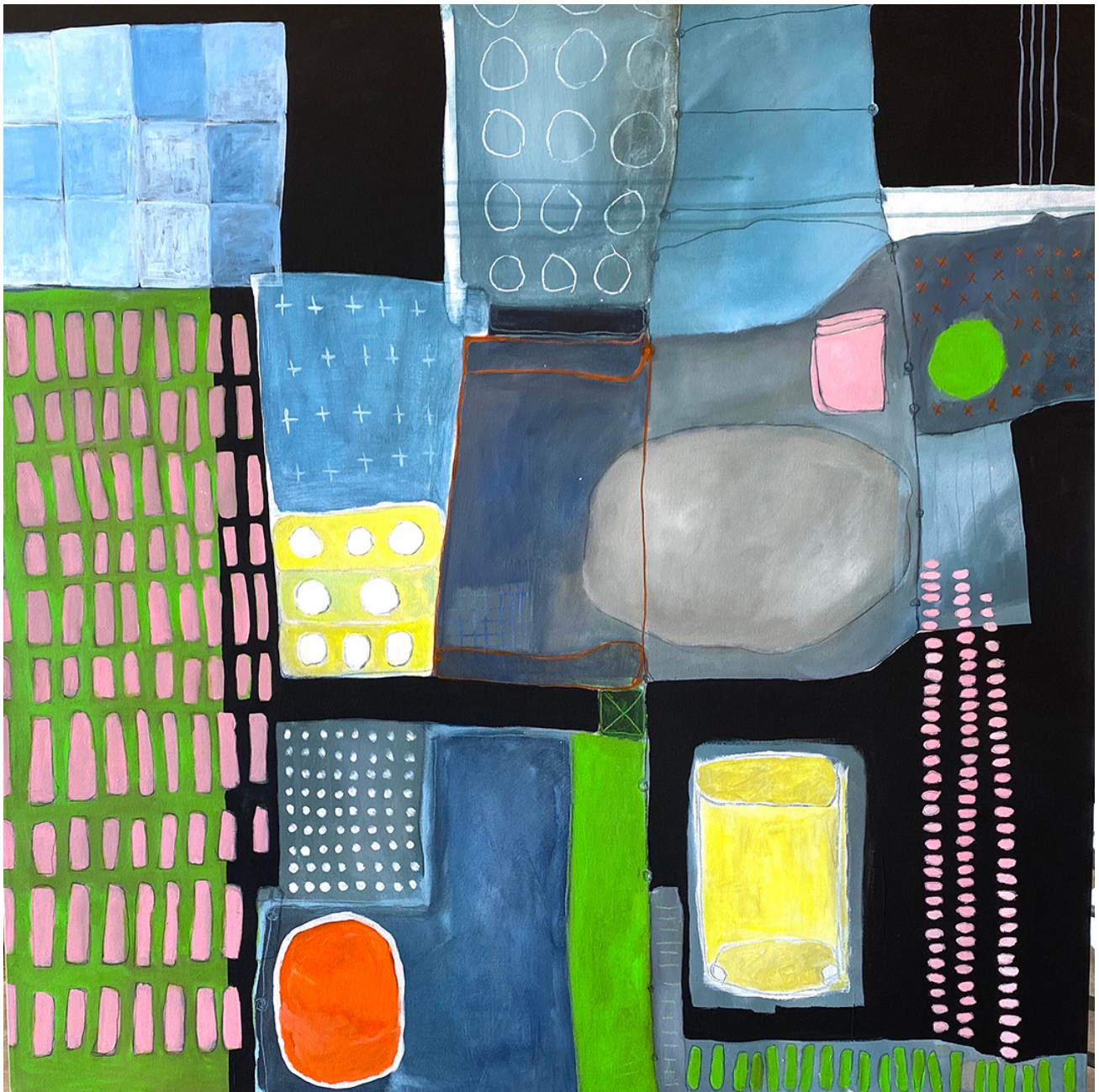
Isaure de La Presle: Tapestry, mixed media, (44 x 44 inches)