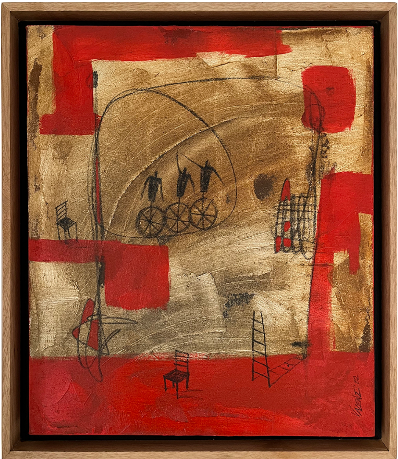
Sergio Valenzuela: Series Escenarios Felices, Mixed media on canvas, 19 x 17 inches, 2022.