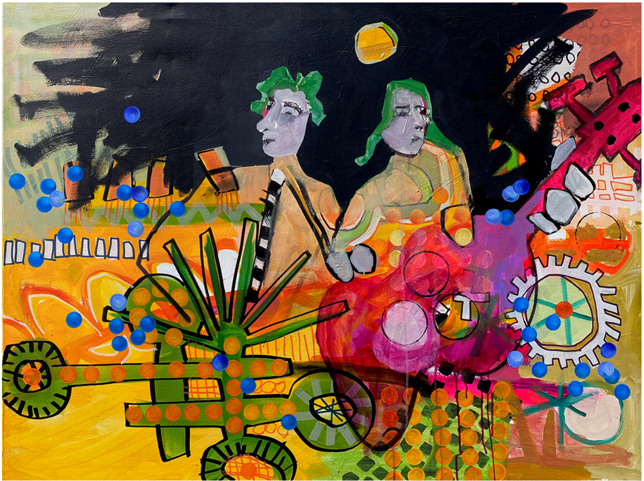
Robin Walker: Modern Folk Duo, acrylic, (36 x 48 inches) from the artist's Music series.