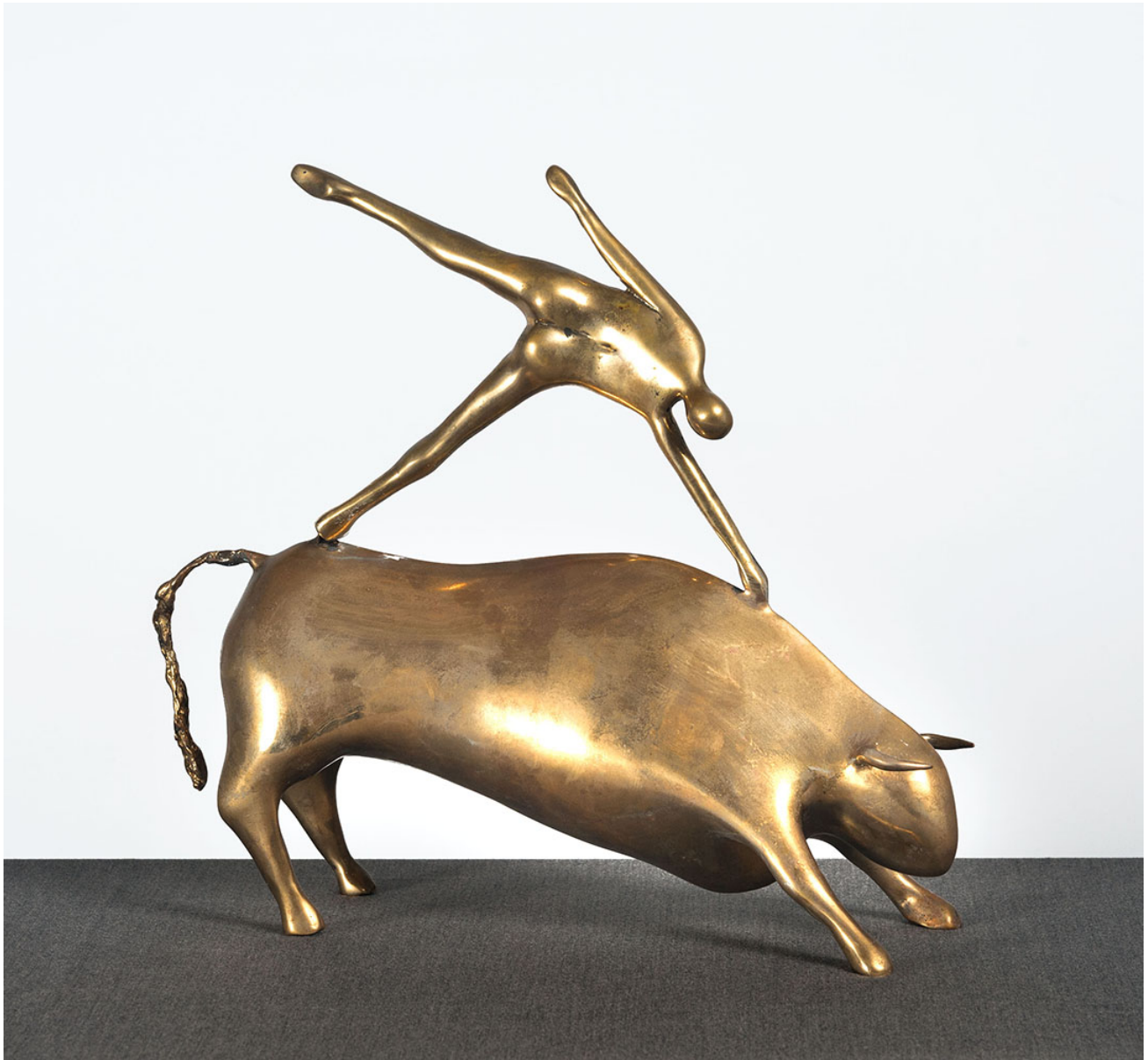
Kostis Georgiou: "Pegnyon" Bronze Sculpture. 34 X 34 X 12 inches

paintings and monumental sculptures which have been installed in public spaces across Europe and Asia.