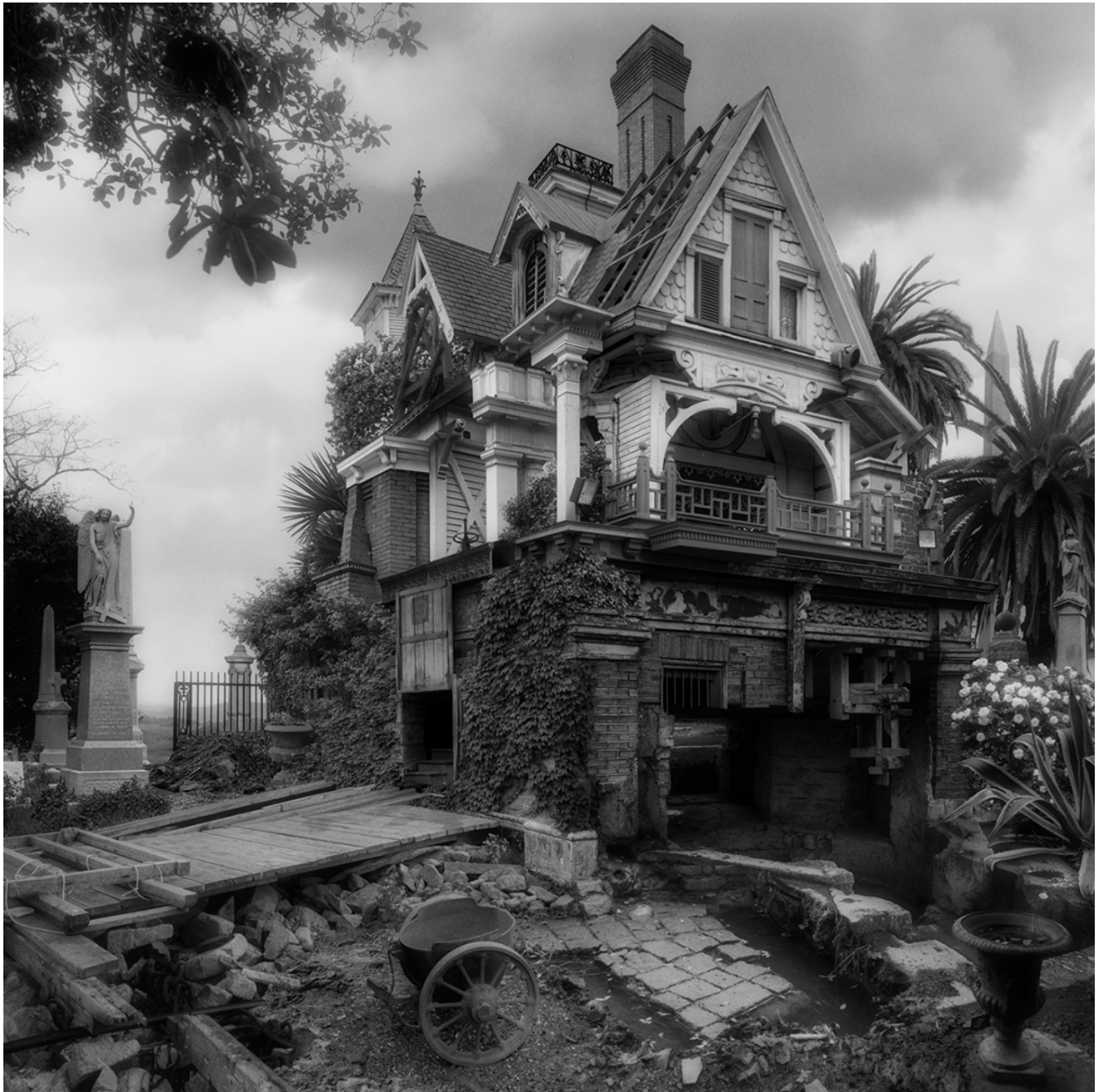
Jim Kazanjian: Untitled (Gatehouse), Digital photo composite on archival pigment print. (18 x 18 inch image on 20 x 20 inch paper), Edition of 10, 2021.

Jim Kazanjian is a photographer based in Portland, Oregon. Delving through a pool of thousands of images, he pieces together composite digital photos that, while completely distinct from each other, combine to create a bizarre world.