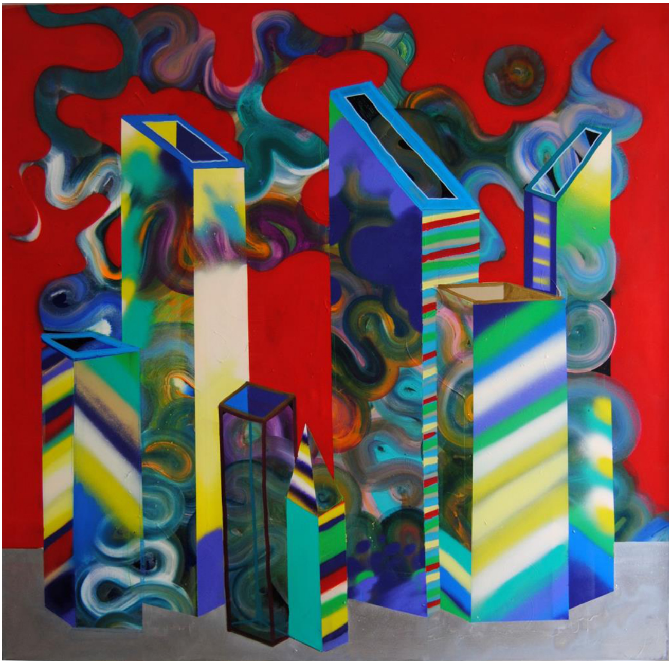
Woozy: City Vibes 2 , 10294, Mixed Media on Canvas, 52 x 51 inches (131.5 x 130 cm)