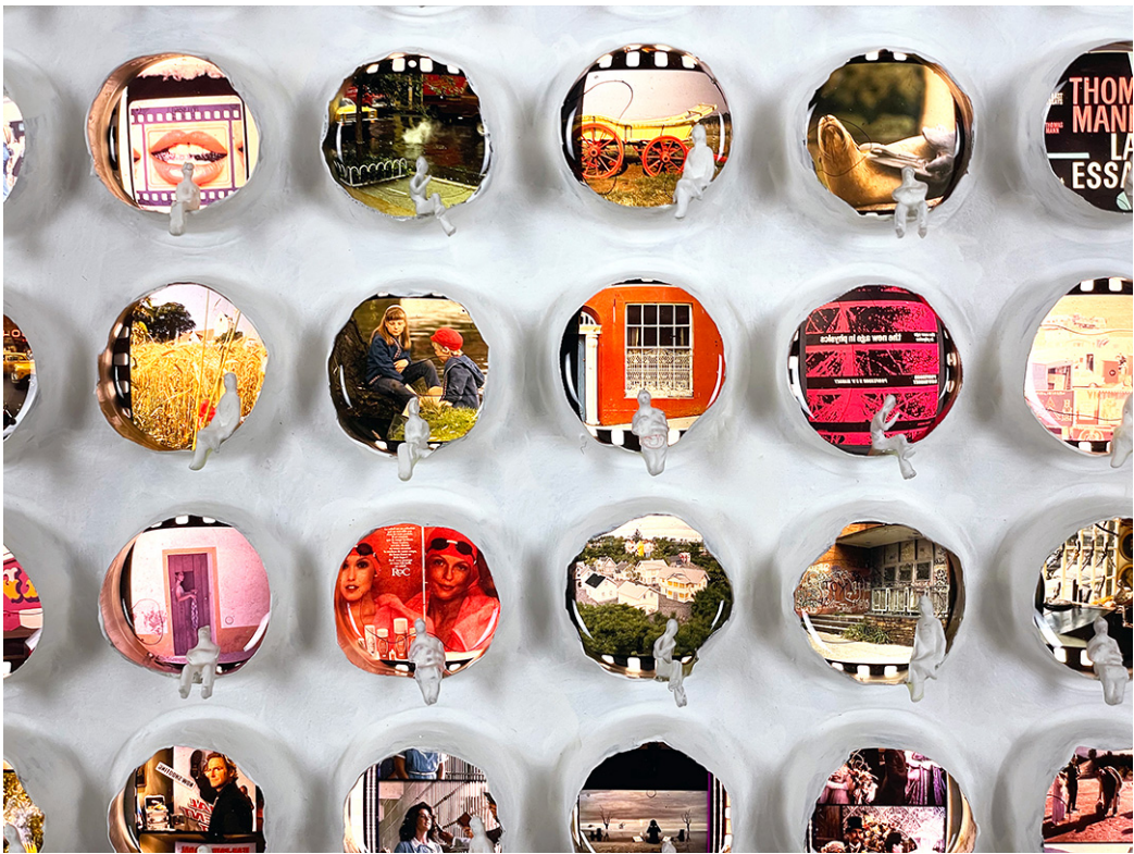
© Mat Kemp. Above 1 (Top): Intermission . Above 2: Intermission, Detail . Courtesy Cube Gallery