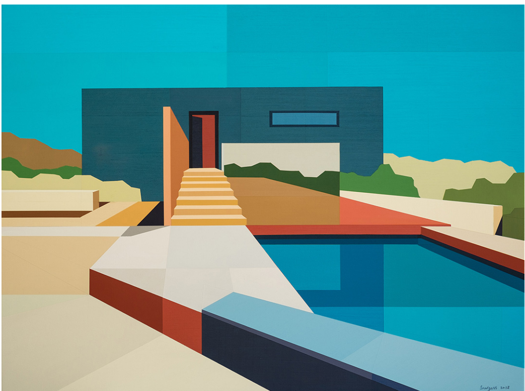
© Andy Burgess. Concrete Desert House . Courtesy Cynthia Corbett Gallery

The artist's new works are imaginative recreations and curious playful inquiries into our place in the world. Reis proposes new ways of seeing and understanding our natural environment through painting and sculpture, testing the boundaries of logical systems. By considering the contradictory implications of the word natural, and exploring relationships between the human and non-human, Reis embraces possibility through work that is joyful and hopeful.