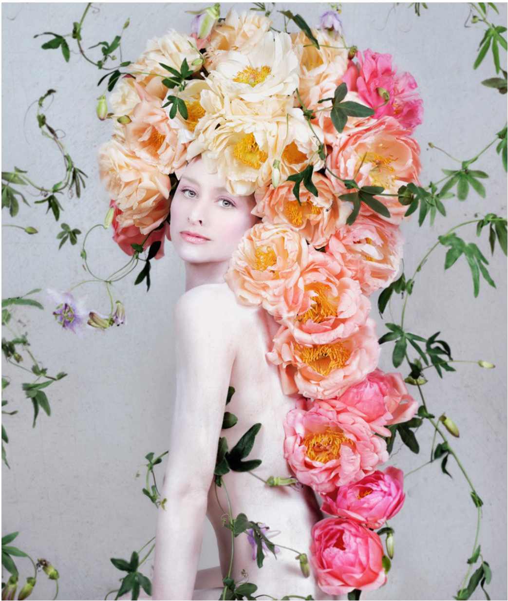
© Isabelle van Zeijl. A New Dawn . Courtesy Cynthia Corbett Gallery

The artist's new works are imaginative recreations and curious playful inquiries into our place in the world. Reis proposes new ways of seeing and understanding our natural environment through painting and sculpture, testing the boundaries of logical systems. By considering the contradictory implications of the word natural, and exploring relationships between the human and non-human, Reis embraces possibility through work that is joyful and hopeful.