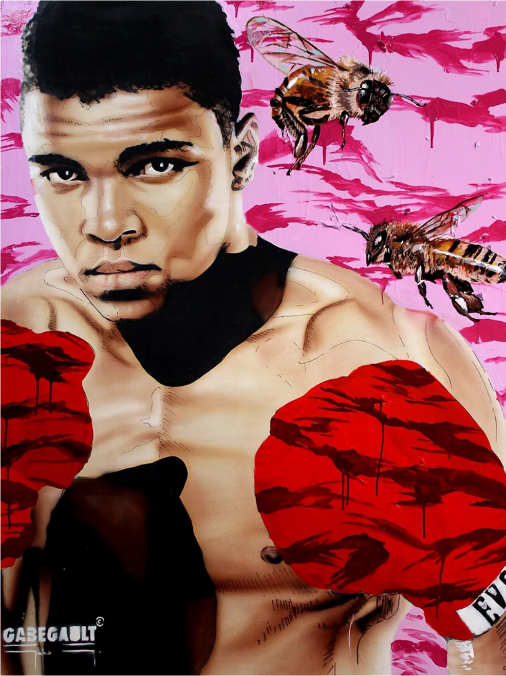
Ali.

For more information on this program and student submissions, visit: AthletesforLife.org .