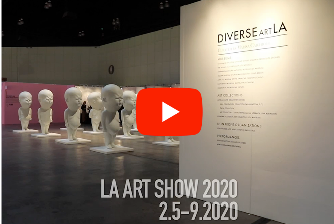
Highlights of the DIVERSEartLA Program at the 2020 LA Art Show

We are honored that St. Jude Children’s Research Hospital® will return for a seventh year as the exclusive Charity Partner of the LA Art Show in 2021. St. Jude Children’s Research Hospital is leading the way the world understands, treats and defeats childhood cancer and other life-threatening diseases. The purpose of St. Jude is clear: Finding cures. Saving children.®