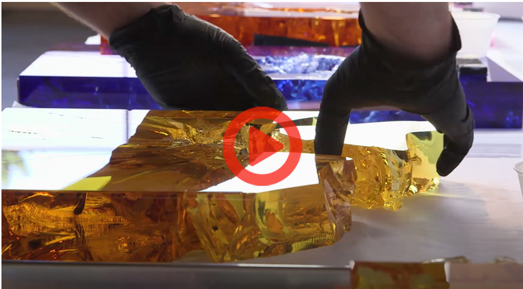
View Thermal Fractograph Video

For more insight into Kiley's work, view footage of his Thermal Fractograph dramatic process here: