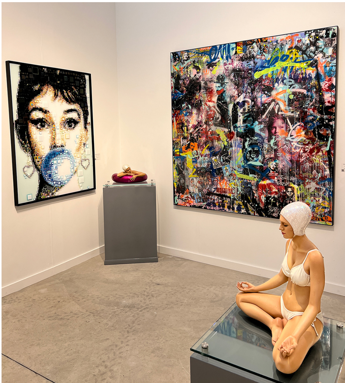
Exhibition installation view.