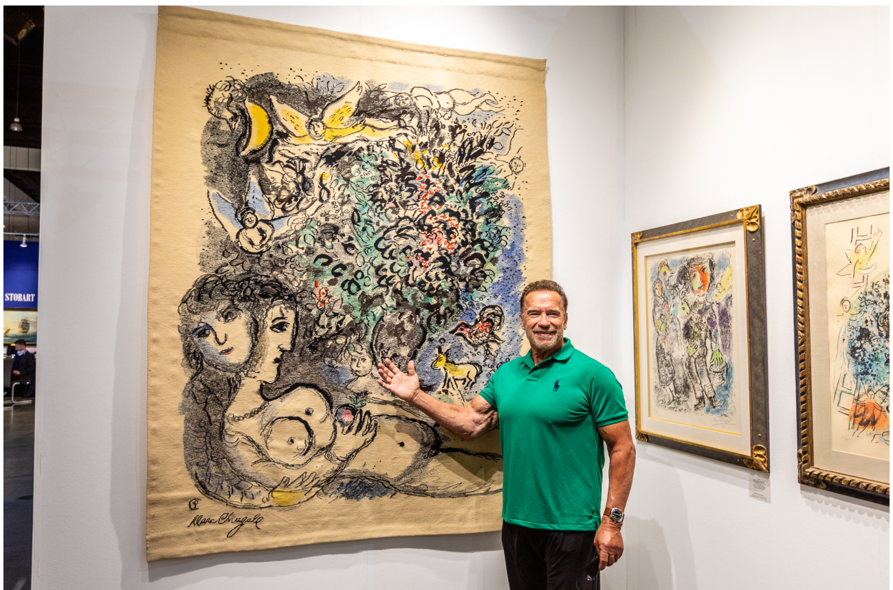
Arnold Schwarzenegger in front of Marc Chagall's "L'Ange passant" tapestry, which was shown in the Jane Kahan Gallery at this year's LA Art Show.