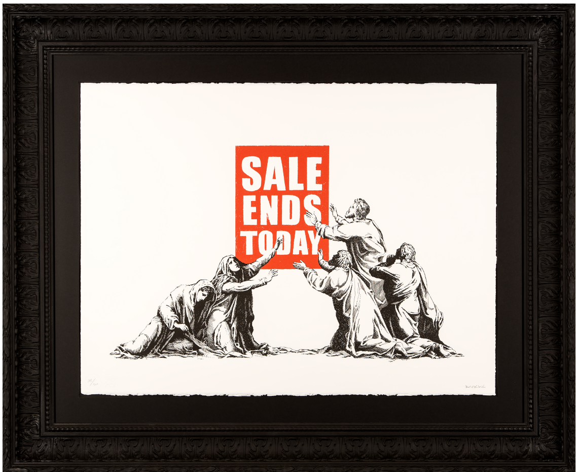
Banksy, Sale Ends Today