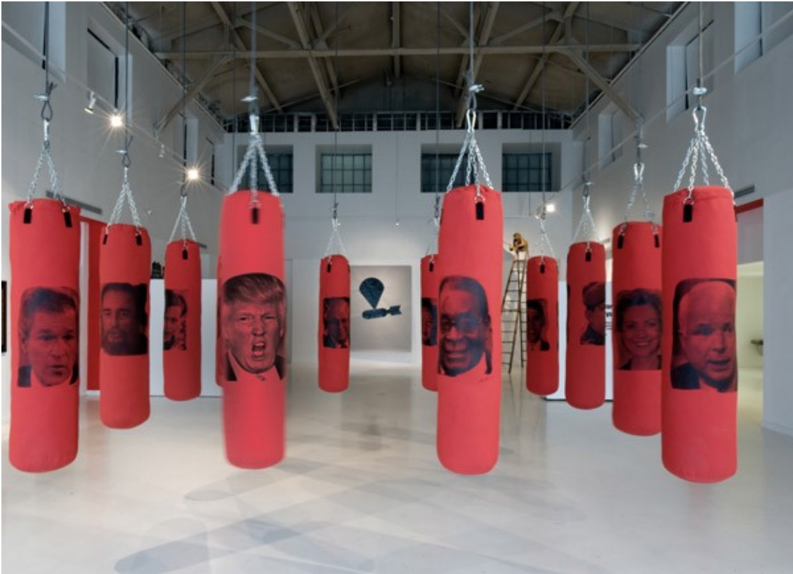
Left or Right Punching Bags by Antuan Rodriguez

specially curated art exhibits, performances and installations by artists from all around the world.