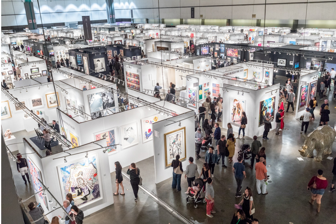
MODERN + CONTEMPORARY section of the LA Art Show