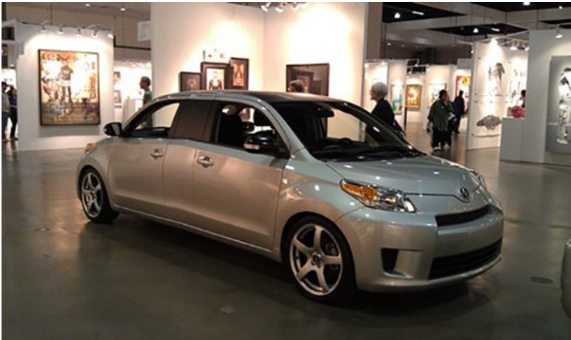
Image: Mark Mothersbaugh's "Scion Car Sculpture".

Among the most popular installations at the 2012 edition of LAAS was Mark Mothersbaugh's "Scion Car Sculpture," which debuted at the fair before its installation at the Museum of Contemporary Art in Los Angeles. Although Mothersbaugh remains best-known as the founder of the new wave/post-punk band DEVO, his participation in the visual art world began much earlier and continues through the present day. The startling, and somewhat surreal, installation featured two Scions which had been cut in half after the driver's seats and re-fused together—creating a mirrored effect—one with two front ends forever in opposition while the other, rendered nearly useless, composed of the paired rear-halves of the two cars.