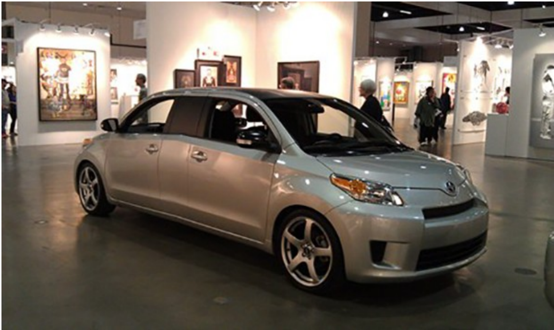
Image: Mark Mothersbaugh's "Scion Car Sculpture".

Among the most popular installations at the 2012 edition of LAAS was Mark Mothersbaugh's "Scion Car Sculpture," which debuted at the fair before its installation at the Museum of Contemporary Art in Los Angeles. Although Mothersbaugh remains best-known as the founder of the new wave/post-punk band DEVO, his participation in the visual art world began much earlier and continues through the present day. The startling, and somewhat surreal, installation featured two Scions which had been cut in half after the driver's seats and re-fused together—creating a mirrored effect—one with two front ends forever in opposition while the other, rendered nearly useless, composed of the paired rear-halves of the two cars.