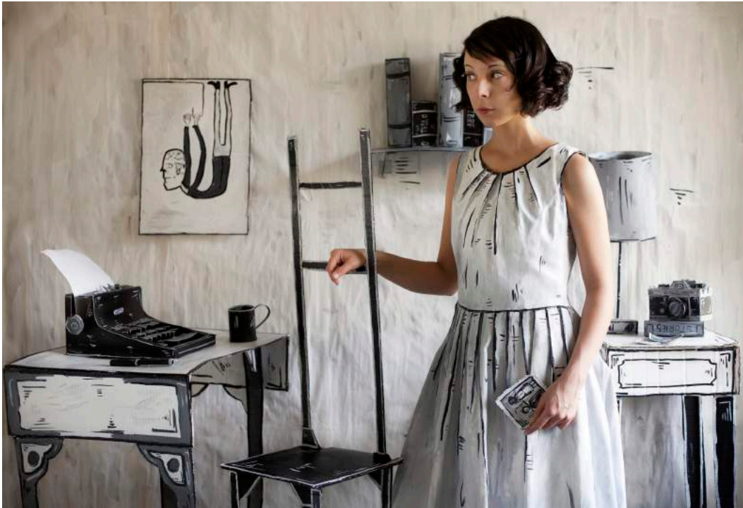
Dosshaus, The Writer's Room , 2014, cardboard, paint and glue, courtesy Dosshaus and LA Art Show 2017

OPENING NIGHT PREMIERE BENEFITTING ST. JUDE CHILDREN'S RESEARCH HOSPITAL JANUARY 11 th , 7-11PM