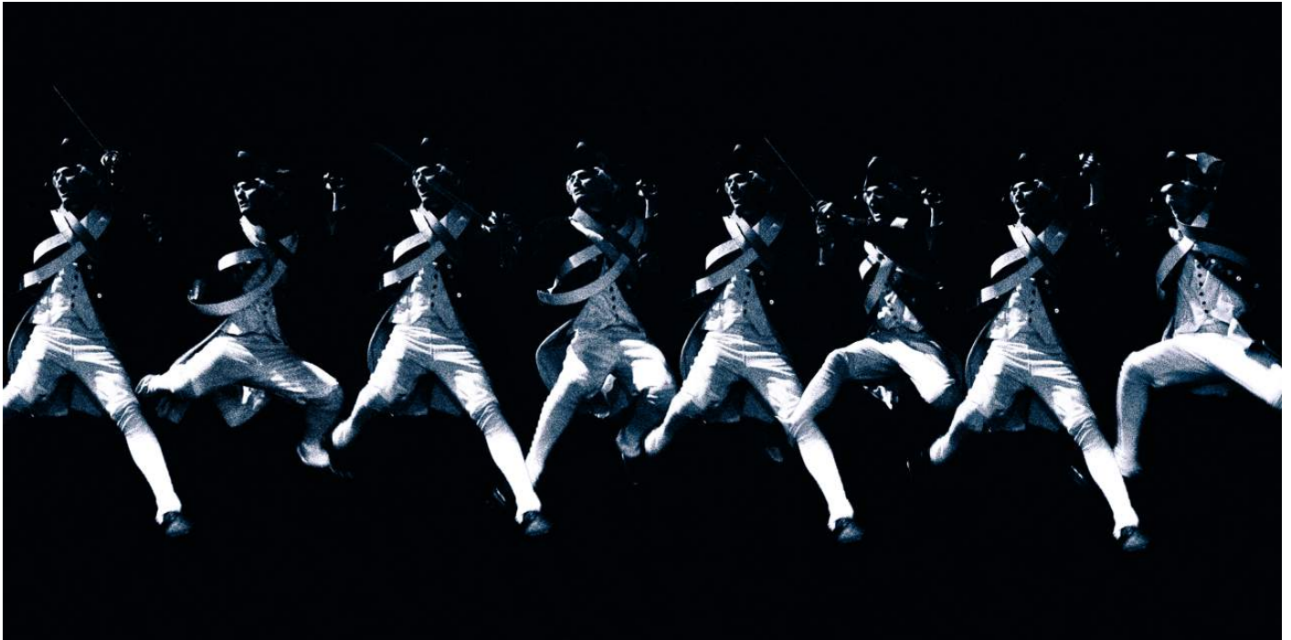
Melanie Pullen, The Jumping Soldiers, #1 (American Revolution) , 2007, courtesy the artist and LA Art Show 2017